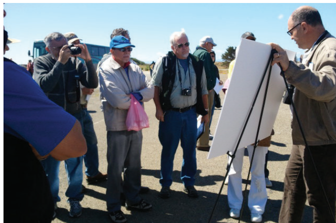
Navy Project Manager Discusses a Site with Community Members During 2012 Site Tour