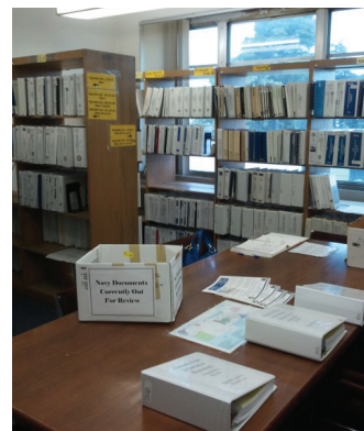
Alameda Point Information Repository

Currently scheduled for the second Thursday of every odd numbered month (January, March, May, July, September, and November). Meetings are 6:30 p.m. to 9:00 p.m. at 950 West Mall Square, Building 1, Room 140, Alameda, California 94510