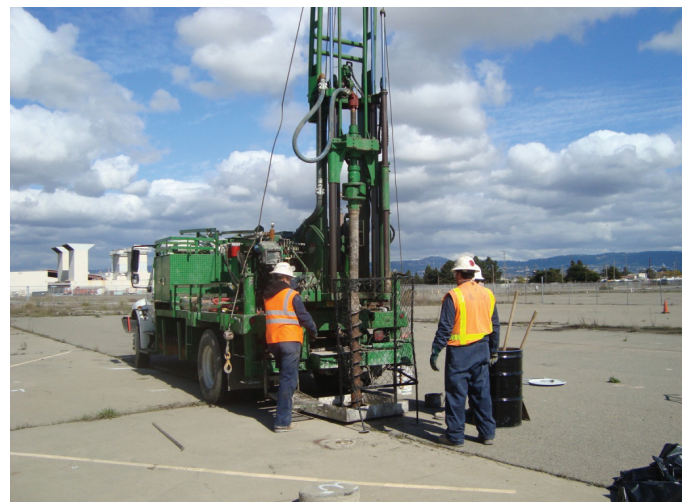
Dual Vacuum Extraction Well Installation at Building 410

Since 2011, the Navy has prepared 65 site closure summaries requesting closure of specific features. The Navy is working with the Water Board to review and close those sites. In 2011, the Navy and its contractor conducted a data gap investigation to evaluate various petroleum sites for potential closure. During the data gap investigation, field workers collected 663 soil samples and 209 groundwater samples to better assess 73 of the open petroleum features. Of those 73 features assessed, 32 are suitable for closure, 15 features need to have associated fuel lines evaluated, and 26 features need additional investigation. The Navy continues to make progress with the petroleum program and plans to conduct additional data gaps investigations, petroleum corrective actions, petroleum program groundwater monitoring, to submit closure requests, and receive additional site closures in 2013.