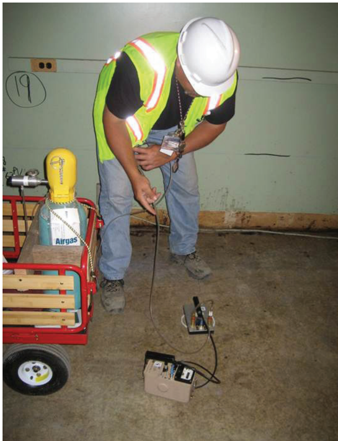
Radiological Technician takes a measurement to detect surface contamination