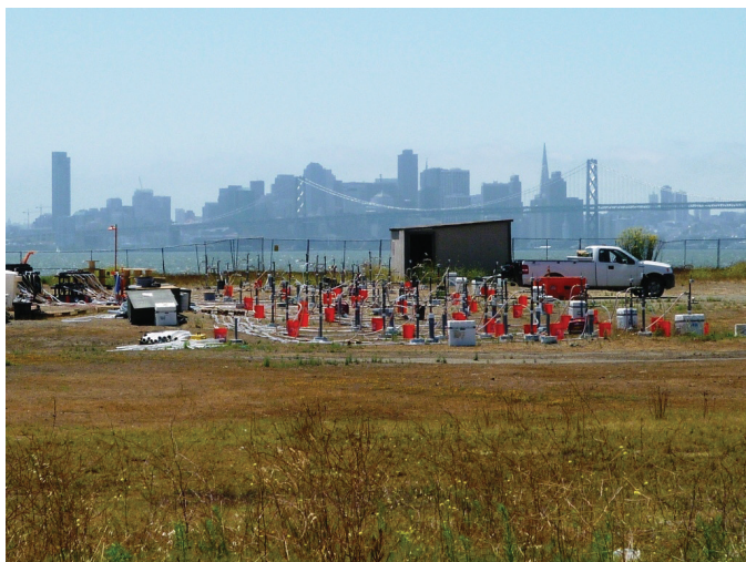
Site 1 Chemical Oxidation Treatment