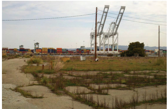
Site 34 Overview